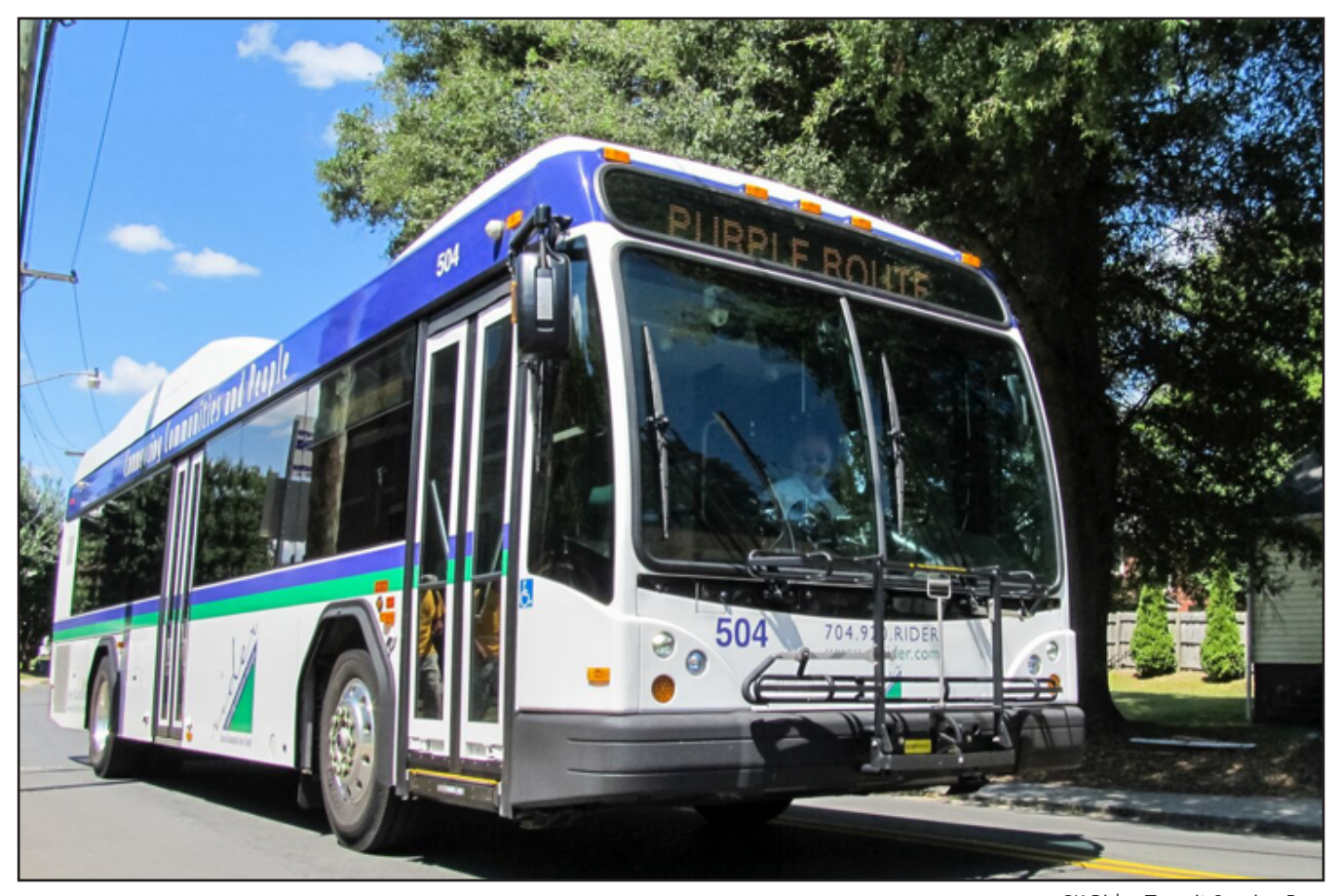
CK Rider Transit Service Bus

The MPO will continue to evaluate congestion criteria and their effectiveness in conveying congestion levels and overall delay. MPO staff compiles information on intersections and travel delay. (As to be expected, several of the intersections overlap with the list of congested corridors.) To further analyze the congested corridors, the MPO will need to conduct more extensive performance measures such as travel time studies. The network will also be reexamined through subsequent accident data and Regional Model updates.