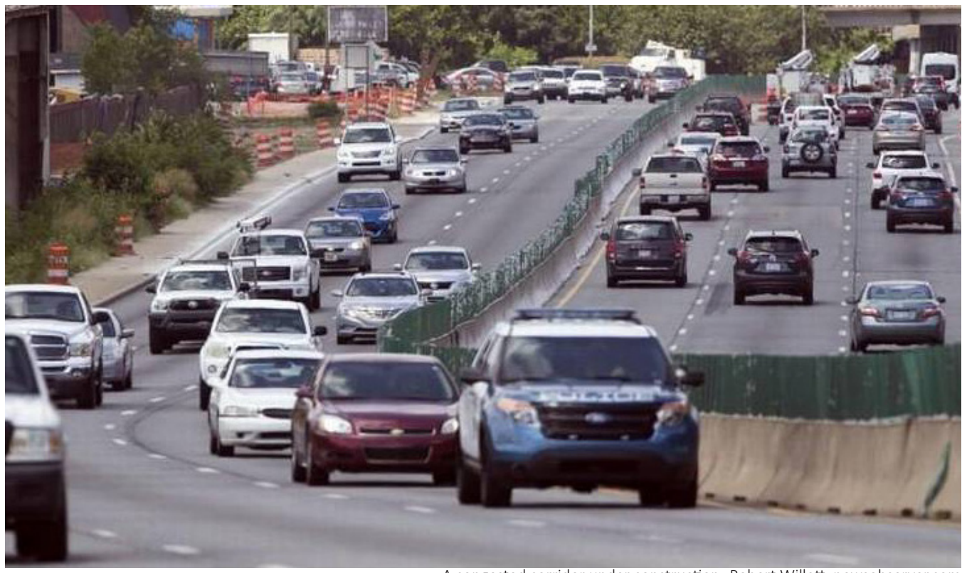
A congested corridor under construction